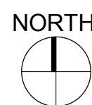
BUILDING U FOUNDATION PLAN